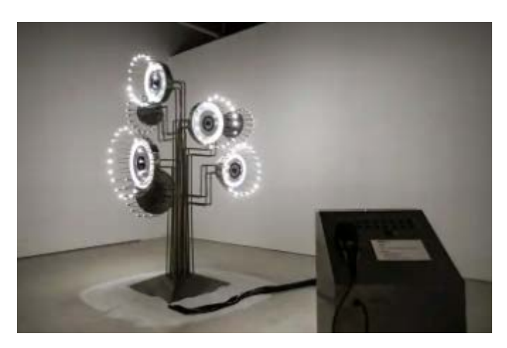
Figure 2. The Era Art Museum presents a new media art installation with light as the theme in its dual exhibitions.